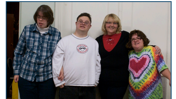
The devoted Homestead volunteer gang!

Nice job everyone. We couldn't live without ya.